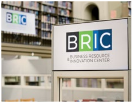
Business Resource and Innovation Center (BRIC)

The BUSINESS RESOURCE AND INNOVATION CENTER (BRIC) offers an extensive collection of print resources and databases for entrepreneurs, small-business owners, and nonprofits, as well as business workshops and networking events. Students and researchers can also access information on health, the natural sciences, home economics, labor, and the trades via our business center at any time. The BRIC contains numerous specialized library services and collections. The PATENT AND TRADEMARK RESOURCE CENTER (PTRC) within the BRIC is one of three in the state of Pennsylvania designated by the United States Patent & Trademark Office (USPTO) to support the public with trademarks and patents. Librarians in the PTRC can demonstrate search techniques, direct users to information, and explain the application process. The REGIONAL FOUNDATION CENTER provides local nonprofit organizations with free access to information and workshops on management, grant seeking, fund development, and proposal writing. Appointments are highly recommended.