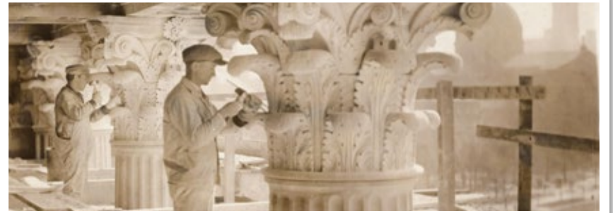
Stone carvers from the John Donnelly Company completing Corinthian capitals, c. 1924–1925

DESIGNED BY JULIAN ABELE , a prominent African American architect from Philadelphia who worked in Horace Trumbauer's firm, the Parkway Central Library first opened its doors on June 2, 1927. As an anchor cultural and educational institution on the Benjamin Franklin Parkway, we welcome over 1 million visitors each year from the city, its countryside, and around the world. Our visitors come to learn from our public events, to consult our special collections, and to tap into the expertise of our librarians and curators in each of the subject departments and special collections. On most days, volunteer docents offer architectural walks through the building.