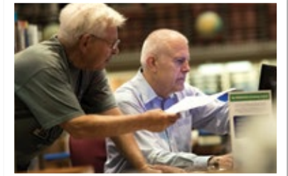
The Workplace, a project of EPR

The EDUCATION, PHILOSOPHY, AND RELIGION DEPARTMENT (EPR) collects print and electronic information on a broad spectrum of education, philosophy, religion, psychology, and librarianship topics. College financial-aid information, test-preparation material, and vocational-technical information are all available here. The WORKPLACE , a project of EPR, assists job seekers in gaining the tools necessary to find work.