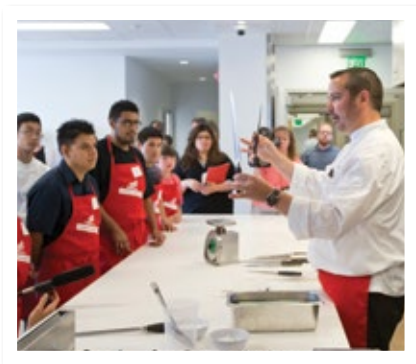
Culinary Literacy Center (CLC)

The Fourth Floor also has spaces available for private-event rental.