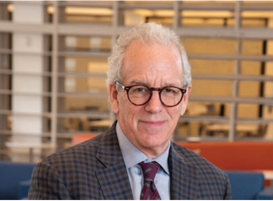
Chair, Board of Directors Free Library of Philadelphia Foundation

“The Foundation, with your generous gifts, will continue to fund critical programs that are making a difference in our communities.”