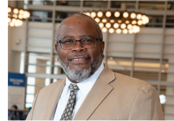
President and Director Free Library of Philadelphia and Free Library of Philadelphia Foundation