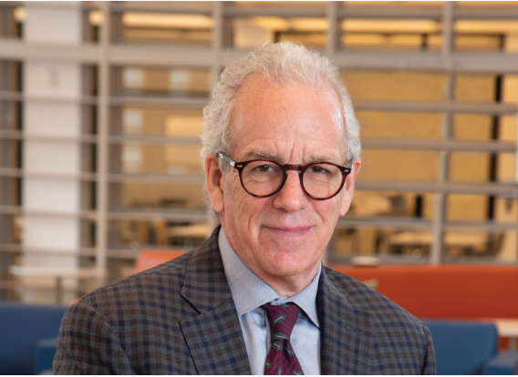
Chair, Board of Directors Free Library of Philadelphia Foundation

“Your generosity and dedication to this organization positively impacts our city.”