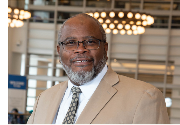
President and Director Free Library of Philadelphia and Free Library of Philadelphia Foundation